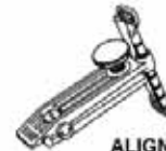
ALIGNER ® CLAMP (ABG)